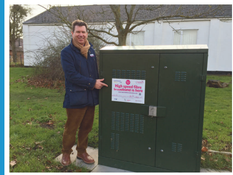
Superfast broadband now in Honeybourne !

Pebworth exchange upgraded, but not yet available. Will be soon!