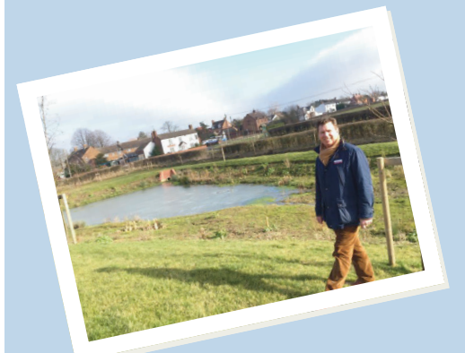
■ New flood alleviation schemes, with over 1.5million litres of water held back from central Pebworth in new flash flood protection