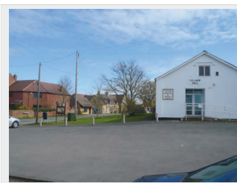
A new Village Hall is destined for Honeybourne, and more improvements to Pebworth Village Hall are planned, both partially funded from Section 106 monies and New Homes Bonus

Wychavon District Council was instrumental in helping the Regal Cinema in Evesham to open its doors again, and is currently working on a major renovation to the town centre in conjunction with Waitrose.