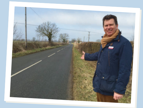
■ Honeybourne Road major repairs and re-surfaced at last!